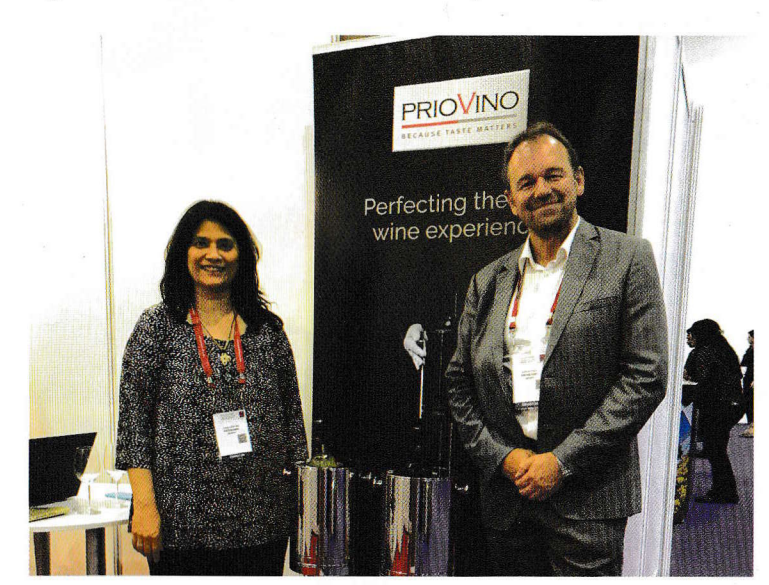
Even while its patent is pending, the PrioVino Premier is available to interested buyers.

PrioVino Premier is available to interested buyers.